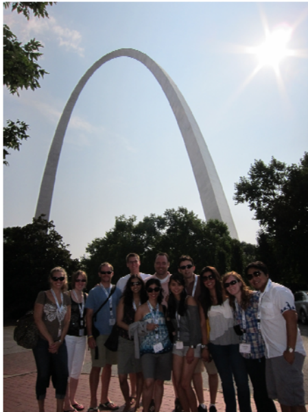
Pictured to Right and Below: Class of 2012 and 2013

It was an enjoyable weekend, allowing the new residents to get introduced to the profession, to meet residents from other schools, and get re-acquainted with people on the orthodontic interview trail.