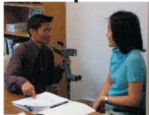
4. "I insist you include this in my person centered plan."