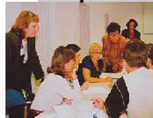
5. "This training would be more parent-friendly if..."