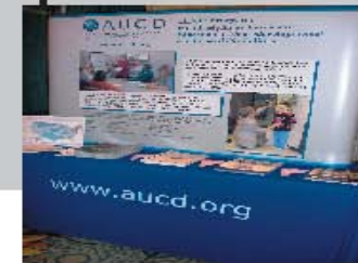
7. EDUCATE the community and legislators about the UCEDD's projects