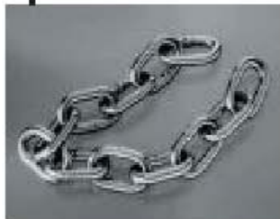
1. Participate in civil disobedience