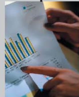
8. Help Develop Five Year Plan