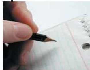
3. ADVOCATE for the needs of PWD's with your legislator