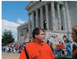
2. Rally against health care cuts at state capitol

Typical CAC activities are shaded CAC Advisory Capacity