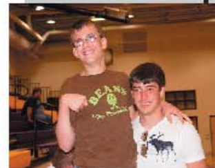
6. "My personal experience helps the UCEDD meet the needs of the community."