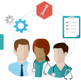
Figure 1. Key Players to Engage