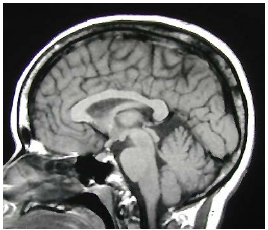
Normal Brain Structure

2. Do the MRI images provide evidence that prenatal FLORATRYP exposure causes structural changes in the brain?