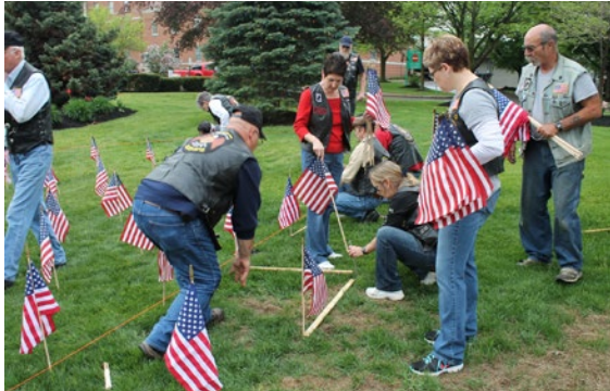
Members of the Wellsville American Legion and Auxiliary, the Legion Riders, and the Sons of the American Legion, teamed up with JMH to put up a Field of Flags in memory of deceased veterans.