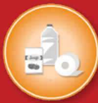
Food and Supplies