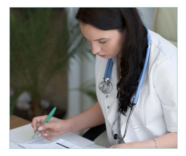
Results to Date in Colorado

Colorado phased in the withhold process; in the first year of the program, no money was withheld from RCCOs and PCMPs, and the withhold began in year two. The 2015 annual report notes that, "Postpartum care increased significantly with the amount of time spent in the ACC program" from 60 percent in the first six months spent in the program to 70 percent for seven to 10 months spent in the program.<sup>45</sup> Four RCCOs met either a tier one or two target in the October 2015, January 2016 and/or April 2016 quarterly reports<sup>46,47,48</sup> RCCO improvement strategies include developing and distributing patient tip sheets and other educational materials; collaborating with Special Supplemental Nutrition Program for Women, Infants and Children (WIC) clinics to share postpartum information with women; and implementing enhanced care management or outreach. The RCCO in the Colorado Springs area, for example, has a pilot with the state's health information exchange that uses daily data reports to identify families for care coordination or outreach in the postpartum period.