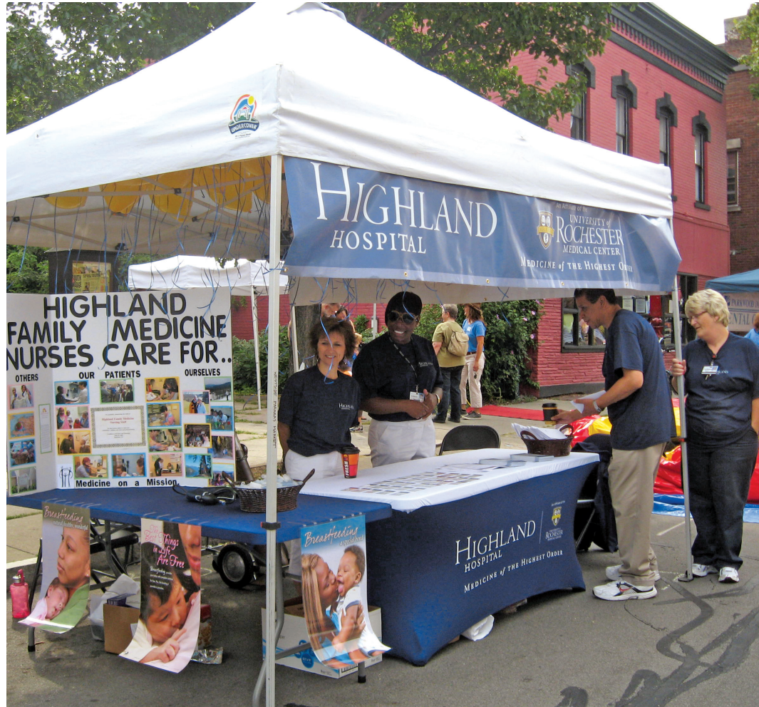
The Department of Family Medicine participates in many community events. Staff are shown at Wedgestock, an annual event in the South Wedge of Rochester.