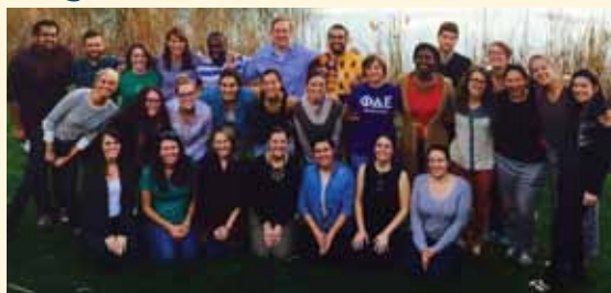
University of Rochester Department of Family Medicine Residents gather for a retreat.

Match Day is an important day in medical schools across the country and this year was ground-breaking for Family Medicine at the University of