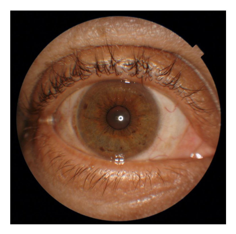
Undilated pupil- may create shadows/darker areas in images- good focus