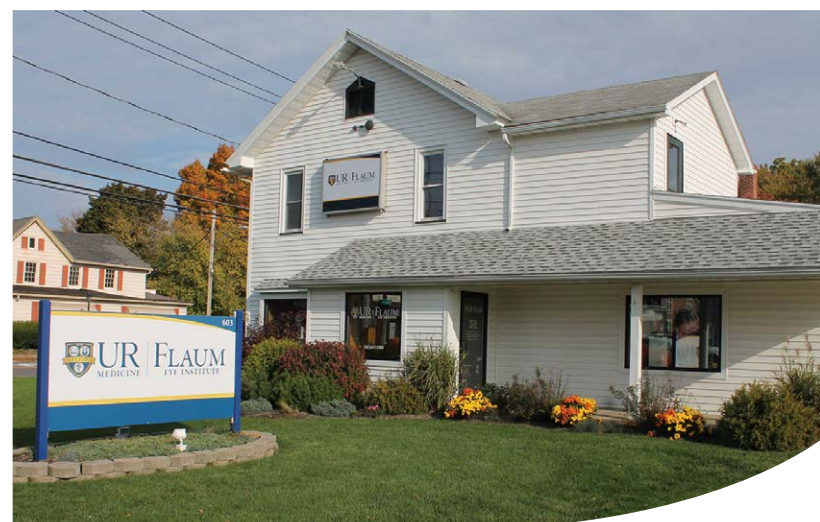
FEI VISIONARY EYE ASSOCIATES IN WEBSTER, NY