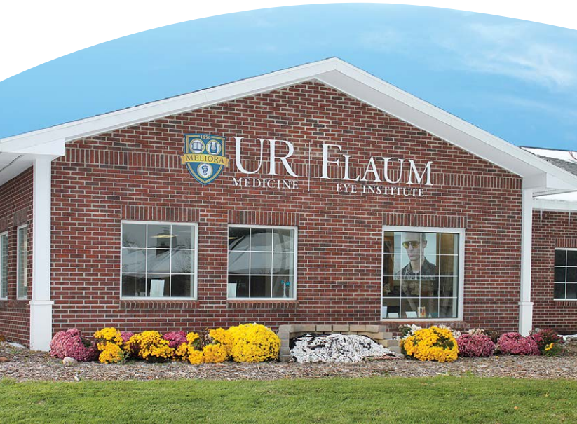
FEI VISIONARY EYE ASSOCIATES IN BRIGHTON, NY