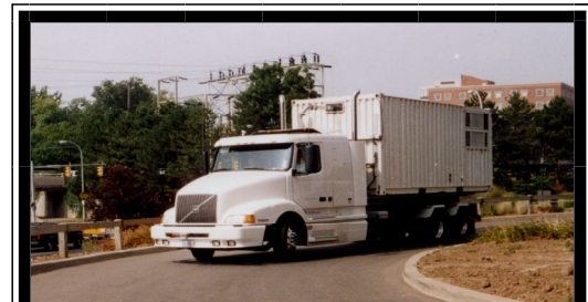
Truck/mobile laboratory that was used in this study