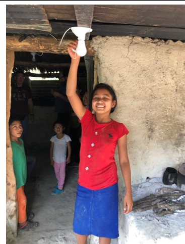
A young lady finally getting light in her home in the middle of nowhere