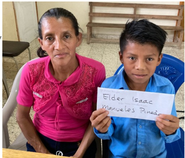
First year of scholarship for this 7th grader

Two years of remote learning, without benefit of modern technology, have resulted in students being advanced thru successive grades without meeting academic requirements, in many cases. During our Spring Brigade, the schools were operating under “recuperation” -- working hard at backfilling missed material. May testing had been postponed into June. We do expect to receive June test reports for all our scholarship students. The schools are keenly aware of the challenge of catching up to standard, a problem shared by many American schools for similar reasons.