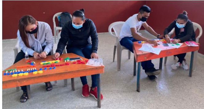
Geometry class for teachers