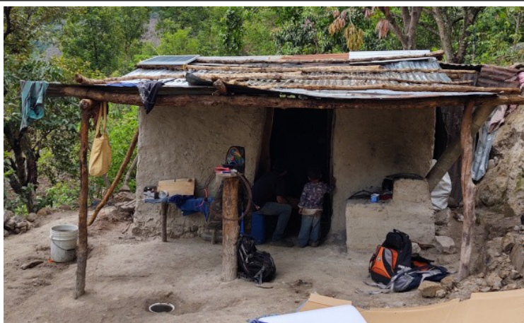
Notice the panel on the left side of the roof. The roof is held on to the house with tied wires.