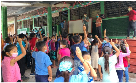
Education on oral care

One thing we found was that nearly every patient we saw was in need of dental care, so it was unfortunate that we were not able to have a dentist with us this trip. However, we were at least able to take one day to travel to one of the neighboring towns to apply fluoride varnishes at the local school (Portillon). We performed around 160 varnishes in total. Ryan