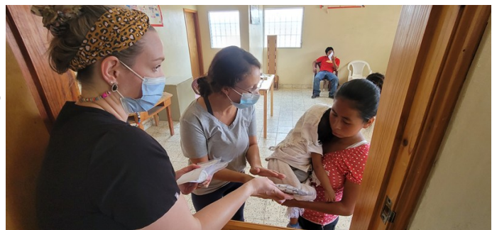
Woman with a sick baby and very limited options for treatment

A number of the patients had seen a health care provider before presenting to our clinic. There are local health centers throughout the country that allow rural communities to access basic health care services. Unfortunately, many community members are referred to hospital for higher level of care, procedures or diagnostic studies but cannot travel there or afford the recommended treatment. A mother brought her 18-month-old daughter to the clinic. The infant was ill appearing with dehydration from a febrile diarrheal illness. Her mother asked if we were able to provide IVF indicating this was recommended when seen at the health post located in San Marcos (1 hour away by motor vehicle but hours away by foot). It was difficult to see her daughter unwell and not be able to offer her IVF, especially