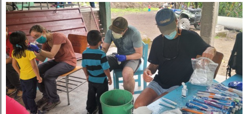
Production line to varnish the teeth of 160 children