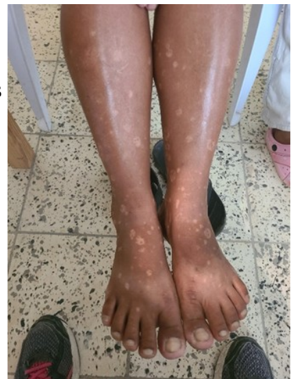
Chronic rash on legs of a patient

One theme with many patients was long delays in proper medical care due to lack of access, especially to specialty or more advanced care. One patient I saw was a young adult who came in complaining of shoulder pain, presenting with his shoulder already in a sling. On further questioning he explained that the shoulder had been dislocated in a car accident 7 months prior, and it had been dislocated ever since then. He said that he had presented to the