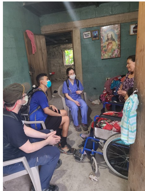
Home Visit for a patient with a Stroke

While working in the pharmacy, I struck up a conversation with a family waiting to be seen for medical consultation, with an adorably playful young girl. A few minutes later, the mother came back to the pharmacy window to ask whether we would be able to assist the grandmother. She opened her phone and showed a photo of a frail elderly woman sitting in a wheelchair with left arm contracture. She shared that the grandmother was paralyzed and experiencing a lot of pain. They were unable to carry her to the clinic and wondering if we could sell a medication to help with her pain. I decided to coordinate a home visit to better evaluate the grandmother. She gave instructions and later that afternoon we visited their home. We took a longer route after getting lost but it was worth it for the views and adventures. Eventually we arrived thanks to