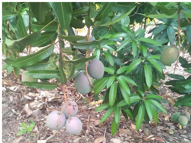
Giant mangoes not affected by recent fire

The most sought after seed of the 15,000+ seeds we brought to Honduras is for a scorpion hot pepper. This is currently ranked as the 3 rd hottest pepper in the world. Six months ago we gave a few seeds to 6 different people. Last trip, only 1 farmer successfully grew the peppers. This trip we had another person successfully grow the peppers. As required, she gave us many seeds from her plants so we can keep sharing the seeds with others. She smiled broadly as she described how painfully hot