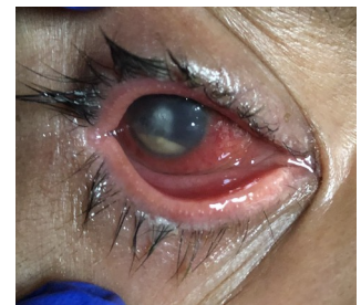
Layer of white blood cells just below the pupil