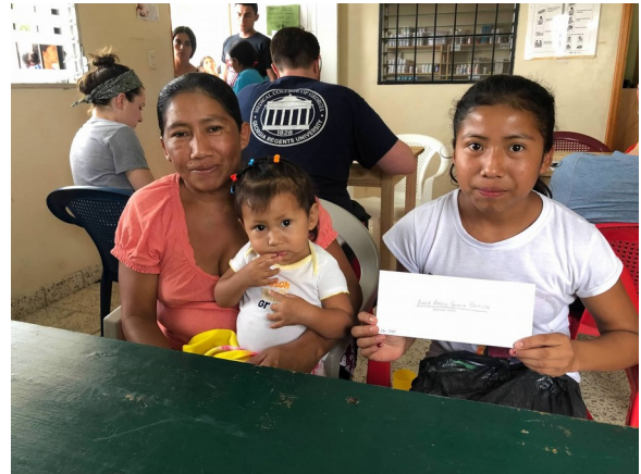
Scholar recipient and mom, happy to receive support to continue school.