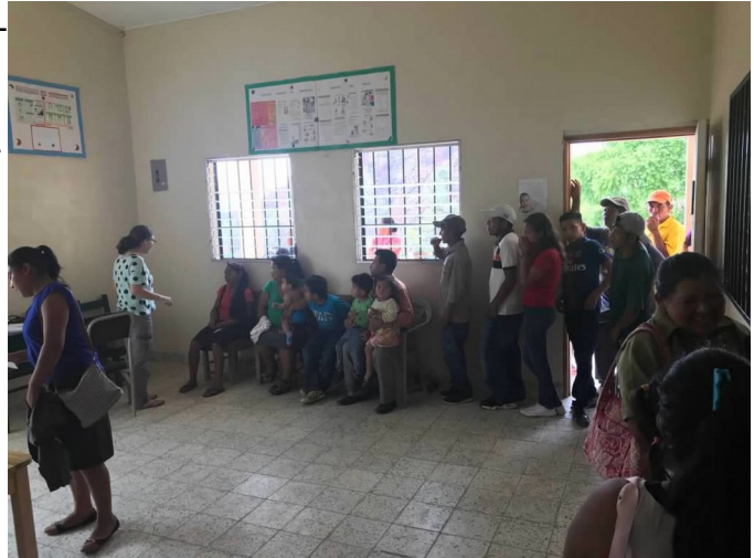
Clinic waiting room, with patients spilling onto the porch