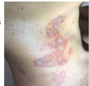
Girl with impetigo on neck

The San Jose Centro school had an outbreak of impetigo. One of the teachers brought a 7-year-old girl to the clinic with impetigo on her nose and upper lip. Listening to her lungs revealed that she had harsh breath sounds in her left lower lobe which was concerning for pneumonia! She also had a fever. We prescribed antibiotics and had her follow up with us in a few days with good improvement. Several other children came to clinic with impetigo on several sites. Shown below are impetigo lesions on one student's neck.