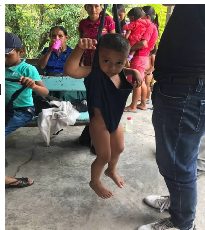
Government-supported baby weighing