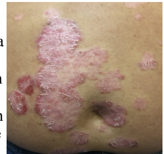
Psoriasis on patient's abdomen