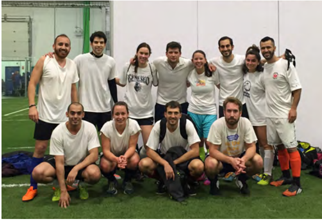
BORUSSIA TEETH SOCCER TEAM

The Eastman orthodontic residents have shown to be skilled both in and out of the clinic. The first (that we know of!) recreational league soccer team was created by the orthodontic residents and strengthened by residents from the general dentistry, pediatric, periodontic and oral surgery departments. We are now competing in a coed indoor soccer league held in Rochester, with an unbeaten record to date. It has been a great opportunity for all of us to bond and share these glorious moments. We will bring home the trophy for the resident's room!