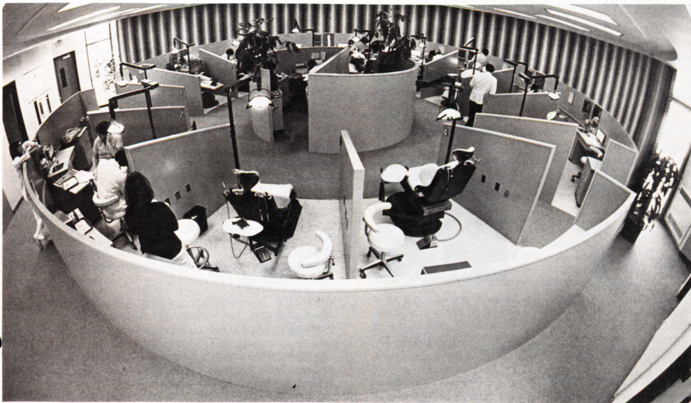
The general dentistry rotunda.