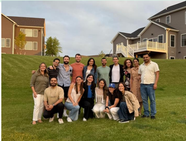
Charles H. Tweed Foundation course in Tucson, AZ in 2025 with our junior residents