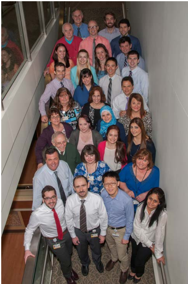
Eastman Orthodontic faculty, staff, and Orthodontic & TMJ residents – 2015