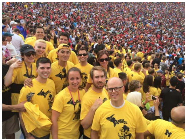
Ortho residents at "The Big House" in Ann Arbor, MI.

say things were never the same! We had an amazing experience getting to know each other, meeting residents from other programs and learning from many renowned orthodontists in the field. Highlights of the weekend included a 3.7 mile kayak trip down the Huron River and a soccer match in Michigan's Stadium "The Big House" between Manchester United and Real Madrid. It was a great way for us to kick off our year together.