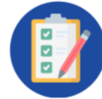
Clinical Research Professionals