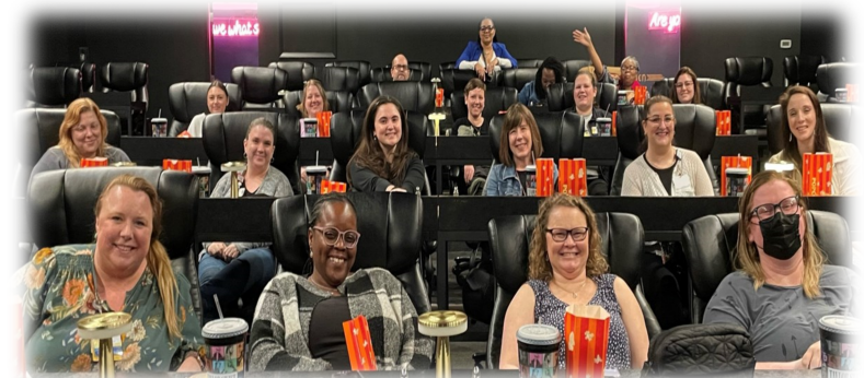
Our team enjoying a team building event at ROC Cinema!