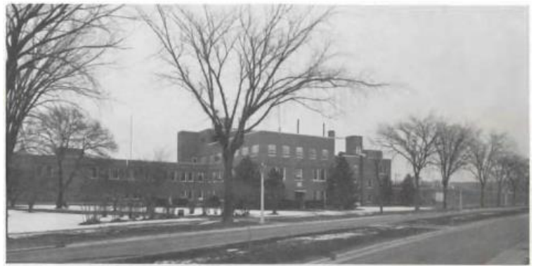
Annex (ca 1962) after addition of third floor to B Wing

The triangular land bordered by the power plant, cemetery, and Elmwood Avenue was developed as the Manhattan Project (Annex Wings A,B,C). Wing A (left) was built a year earlier to accommodate a million volt X-ray instrument for inspection of military castings. After WWII, high voltage source was mothballed and space used for project photography and illustration studio before repurposing as 9.4T MR preclinical imaging facility.