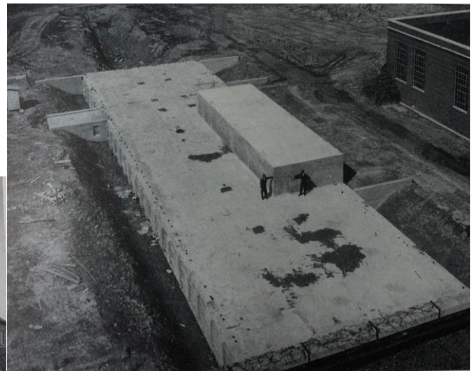
Wing O under construction—April 8, 1949—showing the Radioactive "Hot" Laboratory for the Atomic Energy Commission Project.

Foundation of O-Wing during construction Cesium source location, adjacent to tunnel excavation crossing Elmwood Avenue. Vault for Cobalt 60 source constructed off tunnel under parking lot. Source failed to return to enclosure on first pneumatic activation, required robotic intervention and removal by Oak Ridge years later.