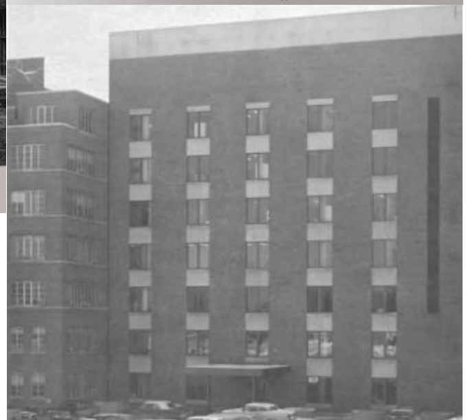
OO Wing - constructed in 1966, adjoining O Wing

1967 aerial photograph was taken as construction of the education (S) wing was getting underway. The Radiation Oncology clinical operation was built in the courtyard between O and GG wings; note there was no construction over this courtyard facility. GG wing adjacent to OO was built as a new animal research facility