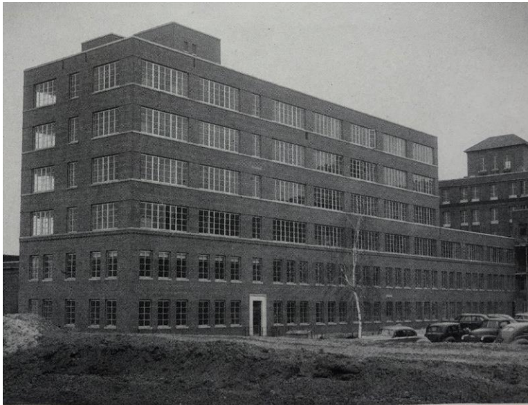
Wing O from the northwest—January 30, 1950.

1967 aerial photograph was taken as construction of the education (S) wing was getting underway. The Radiation Oncology clinical operation was built in the courtyard between O and GG wings; note there was no construction over this courtyard facility. GG wing adjacent to OO was built as a new animal research facility